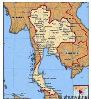
Map of Thailand