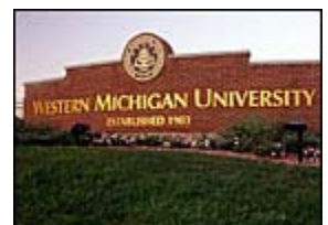
Western Michigan University, home of the IDPE

The Interdisciplinary Ph.D. in Evaluation Program’s (IDPE) mission is to develop thought leaders in evaluation who have: (1) deep knowledge of evaluation theory, methodology, and practice, (2) superior skills in practical and critical thinking, and (3) a knack for seeing opportunities for innovation and improvement. To accomplish this mission, the IDPE is based on the concept that the best way to learn evaluation is by doing it and the best way to develop thought leaders in a discipline is by exposing them to the best and brightest minds available.